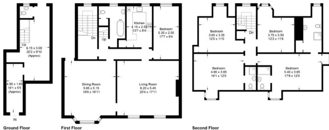
Illustration for identification purposes only, measurements are approximate, not to scale. floorplansUsketch.com © (ID655104)

Approximate Gross Internal Area = 253.8 sq m / 2731 sq ft