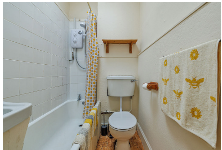
16/8 Channel Street, Galashiels, TD1 1BA

Approximate Gross Internal Area = 66.8 sq.m / 719 sq.ft