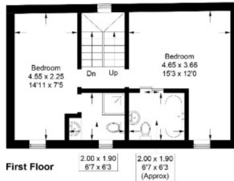
Illustration for identification purposes only, measurements are approximate, not to scale. floorplansUketch.com © (1D1049531)