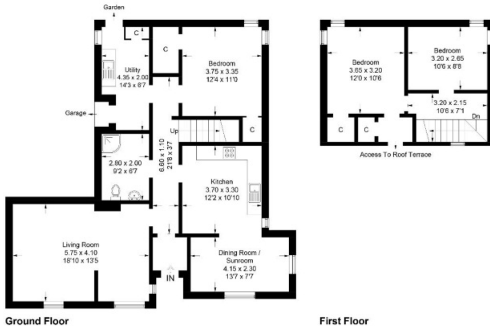
Illustration for identification purposes only, measurements are approximate, not to scale. Fourlabs.co © (ID1156792)

Approximate Gross Internal Area = 124.2 sq m / 1337 sq ft