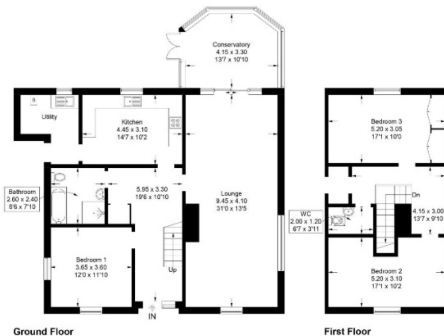
Illustration for identification purposes only. measurements are approximate, not to scale. Fourlabs.co © (ID1184111)

Approximate Gross Internal Area = 160.7 sq m / 1730 sq ft