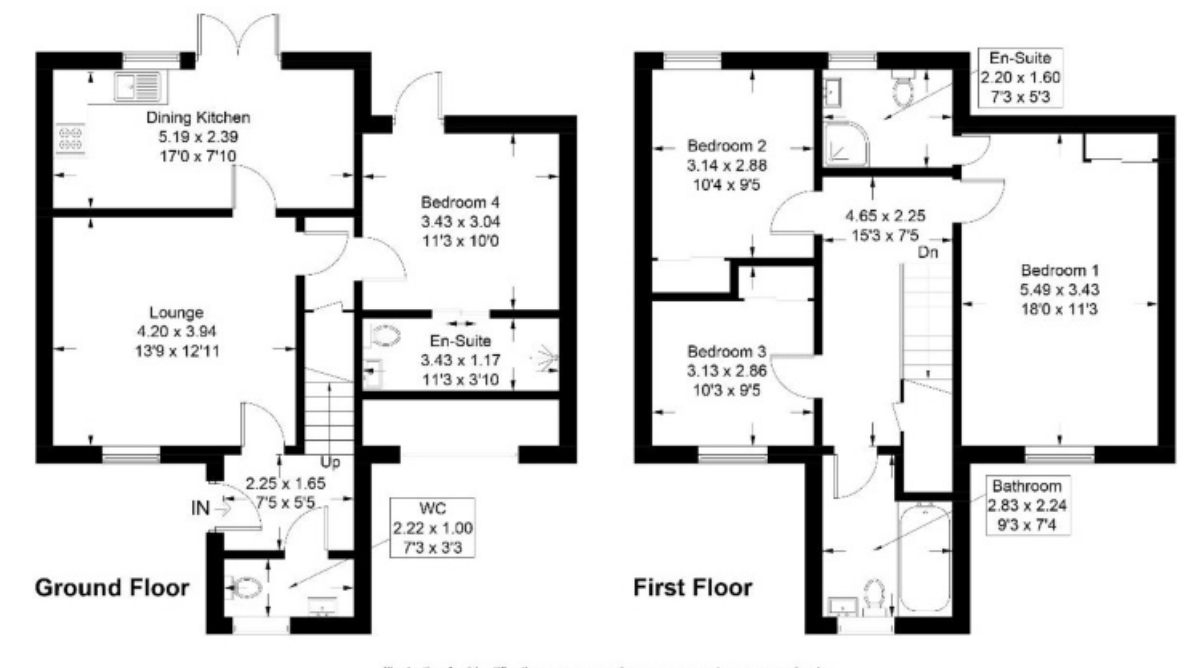
Illustration for identification purposes only, measurements not to scale. Fourlabs.co © (ID1184789) ents are approximate.

Approximate Gross Internal Area = 119.7 sq m / 1288 sq ft