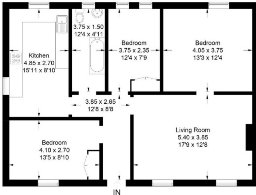
Illustration for identification purposes only, measurements are approximate, not to scale. Fourlabs.co © (ID1226322)

Approximate Gross Internal Area = 85.6 sq m / 921 sq ft