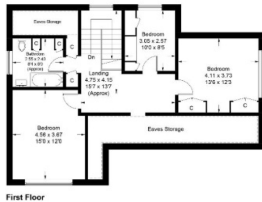
Illustration for identification purposes only, measurements are approximate, not to scale. Fourlabs.co © (ID1246373)