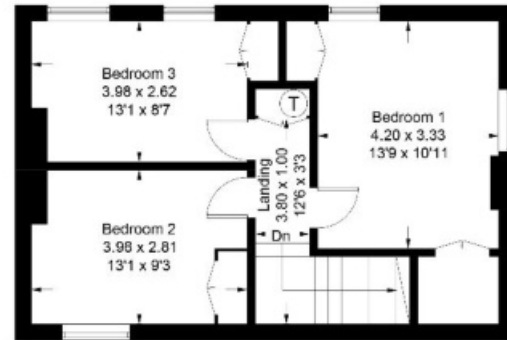
Illustration for identification purposes only, measurements are approximate, not to scale. Fourlabs.co © (ID1289853)