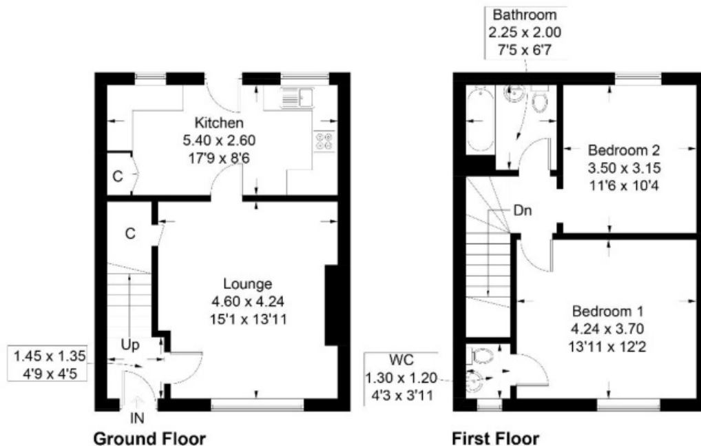
Illustration for identification purposes only, measurements are approximate, not to scale. (ID1290401)

Approximate Gross Internal Area = 81.0 sq m / 872 sq ft