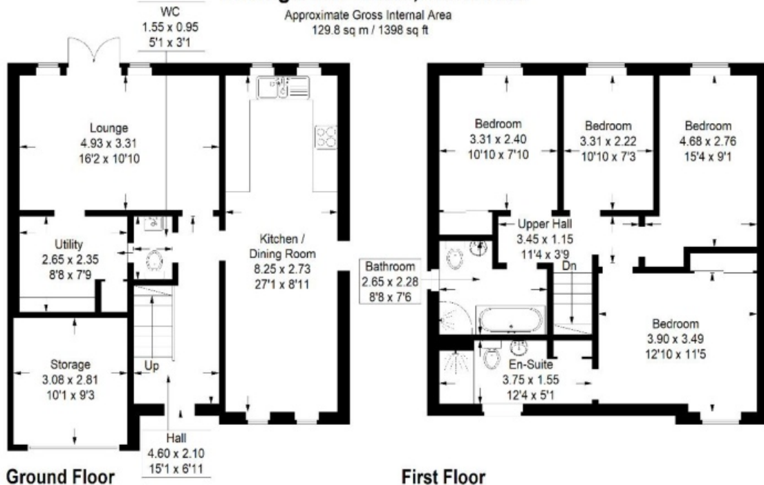
Illustration for identification purposes only, measurements are approximate, not to scale. Fourlabs.co © (ID1292254)

Approximate Gross Internal Area 129.8 sq m / 1398 sq ft